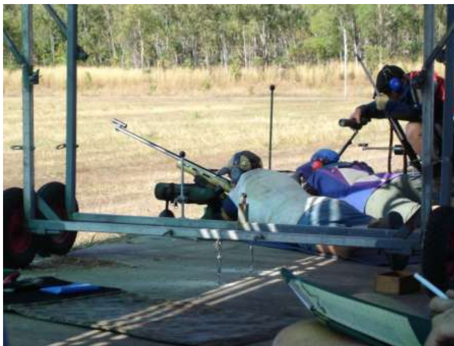
Figure 4 – Shooting in the Shade