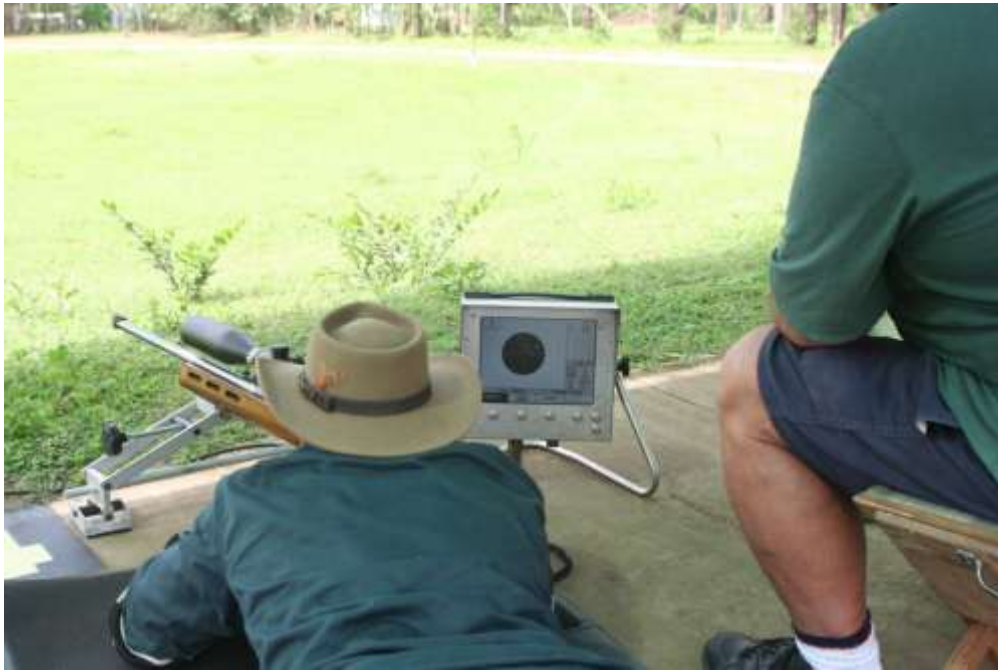
Figure 5 – Shooting with Electronic Targets

Future Works. The following works have been identified as significant development tasks, in both cost and effort, which are still required in order to raise the HRSC to NCS standard: