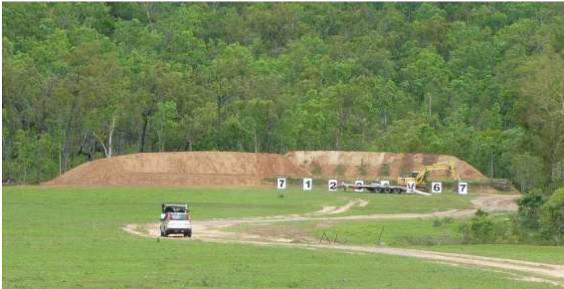
Figure 1 - The New Bullet Stop (Left)

third being funded by the North Queensland Target Rifle Community through TMRC and its project partner NQRA. Figures 1 and 2 show the completed mantlet, target frames and bullet stop.