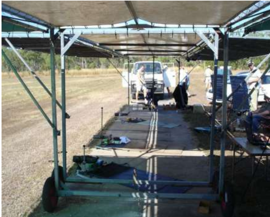
Figure 3 – Mound Shade Trailer