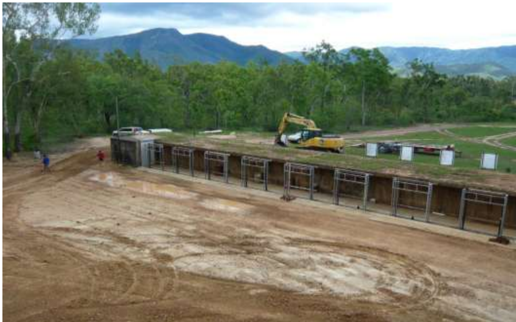
Figure 2 - New Target Frames and Mantlet